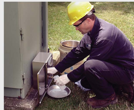
External Oil Sampling