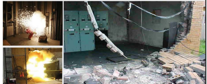
The likelihood of a shock exposure and arcing fault and arc flash increase when equipment is designed, installed, operated, or maintained improperly

Awareness ensures there is a plan and it has considered all the potential risks of doing energized open-panel CBM work. Until the plan is complete and documented, you cannot proceed to the next