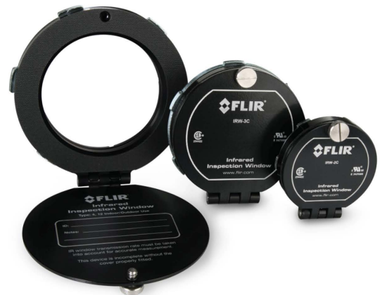
FLIR IR windows come in multiple shapes, sizes and specifications to meet the requirements of the broadest range of applications and installation environments

For more information about FLIR IR windows or to schedule a product